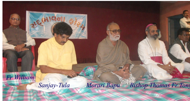
Communal Harmony public meeting St.Xavier's High School, Umreth. 5-01-2012

happy home to live in. SADBHAVNA FORUM which launched 'Communal Harmony Movement' in Gujarat three years ago, takes initiatives for organizing public meetings, dialogues and programmes that will build up and strengthen friendship among the people belonging to different faith. The Forum also celebrates a three day 'Sadbhavanparva'