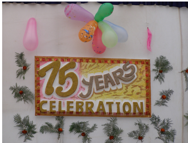
01 st January, 2012, Inauguration of the Platinum Jubilee Year of Bochasan Parish, Diocese of Ahmedabad.